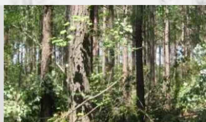
Essex County, Virginia Agriculture & Forestry Industries

Current State & Trend Analysis Report - August 2014