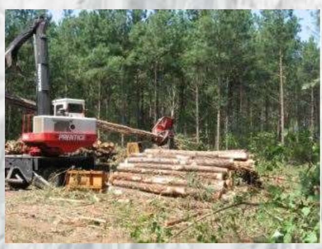
Agriculture and Forestry Industries Development Fund Advisory Board

Essex County Economic Development Authority